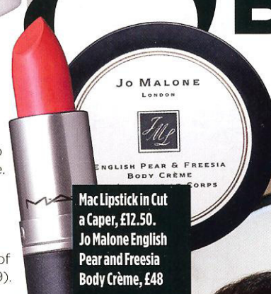
Mac Lipstick in Cut a Caper, £12.50. Jo Malone English Pear and Freesia Body Crème, £48