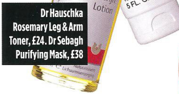
Dr Hauschka Rosemary Leg & Arm Toner, £24. Dr Sebagh Purifying Mask, £38

RACING TO THE AIRPORT? STOCK UP THERE: Heathrow: Cocoon (Terminal 1) stocks niche skincare like Dr Sebagh and Dr Hauschka. Terminal 3 has a huge Mac make-up studio and stand-alone Jo Malone store stocking the full range. The Be Relax spa in Terminal 5 offers everything from Thai & Fly massages to Anti-Jet Lag Facials. The Virgin Atlantic Club House (Terminal 4) has a Cowshed spa and Bumble & Bumble hair salon for last-minute waxing, pedicures and even facials. Gatwick: Clarins Boutique (South Terminal) offers a full range of body, aromatherapy and makeover treatments (01293 507249).