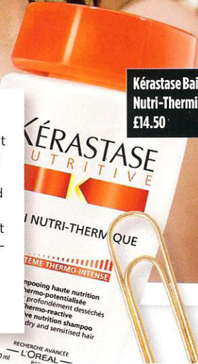
Kérastase Bain Nutri-Thermique, £14.50

(Danielhersheson.com). If you want to exaggerate the look, head to the even hipper Hersheson Blow-Dry Bar outposts at Topshop on Oxford Circus or One New Change by St Paul's, or try the Salonista service at Cobella at Selfridges for its session-inspired looks (Cobella.co.uk). Newcastle: Hooker & Young – for beautiful, wearable styles (0191 281 6714).